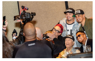
The man who coined the phrase "Oldies but Goodies," honoree ART LABOE, takes photos with group of young admirers.