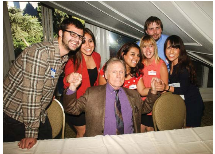
At each PPB Celebrity Luncheon, RALPH EDWARDS Productions sponsors a table for aspiring broadcasting students from area colleges and universities. Honoree DICK CAVETT met with students from Pasadena City College and Fullerton College at the November 7 luncheon. In spite of many pitfalls ahead, Dick declared that all of them "are going to make it."